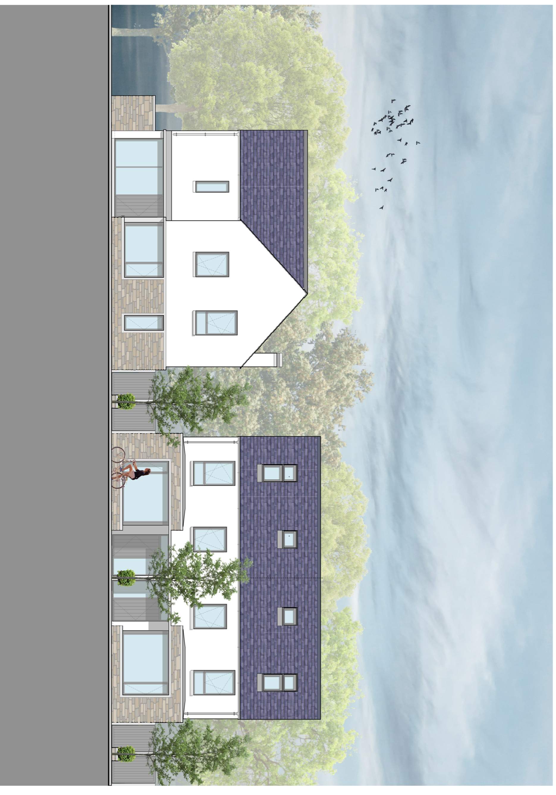
HOUSE TYPES C and B - FRONT ELEVATION SCALE 1:100